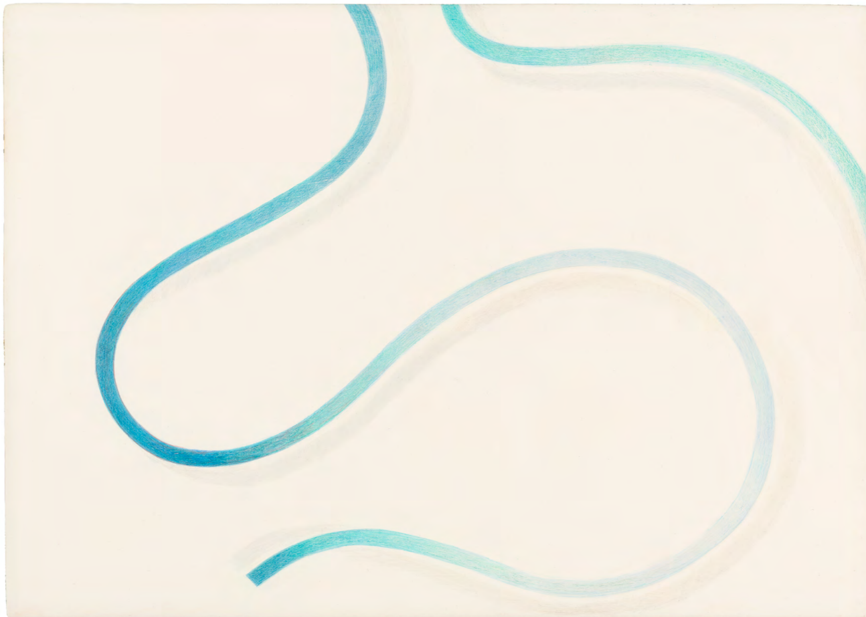
Annabelle d'Huart Untitled (from the Tabulae series), 2020

Colored pencil, Meudon whiting, and gold leaf on wood 10 1/2 x 15 in (27 x 38 cm) DHUART024