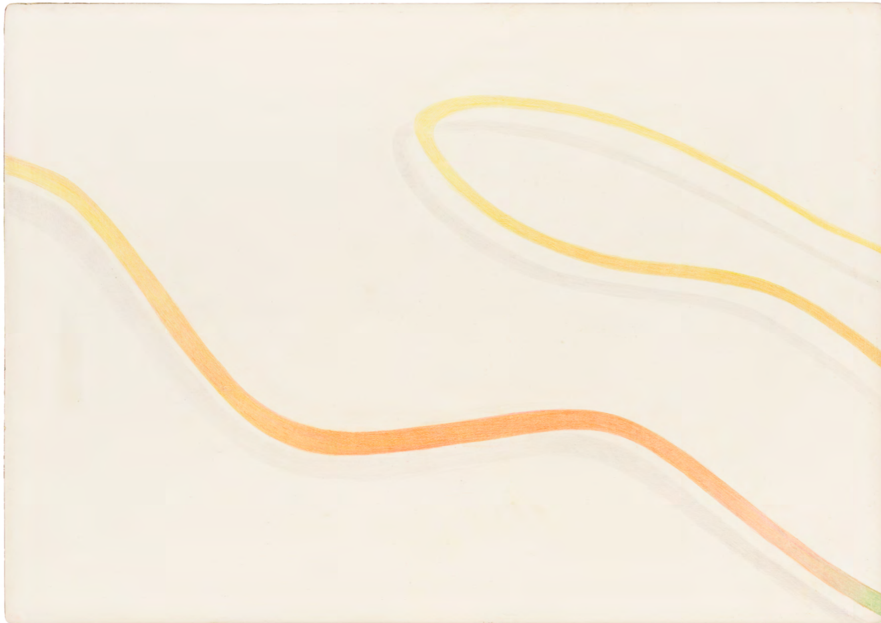
Annabelle d'Huart Untitled (from the Tabulae series), 2020

Colored pencil, Meudon whiting, and gold leaf on wood 10 1/2 x 15 in (27 x 38 cm) DHUART027