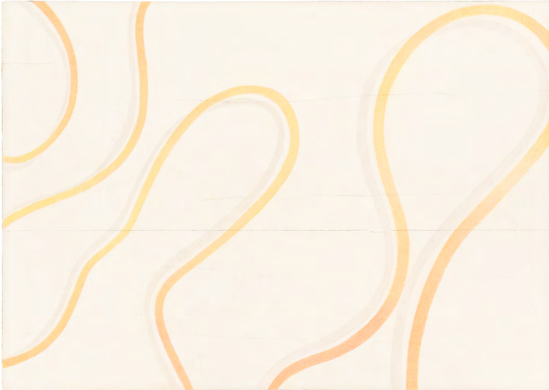
Annabelle d'Huart Untitled (from the Tabulae series), 2020

Colored pencil, Meudon whiting, and gold leaf on wood 10 1/2 x 15 in (27 x 38 cm) DHUART010