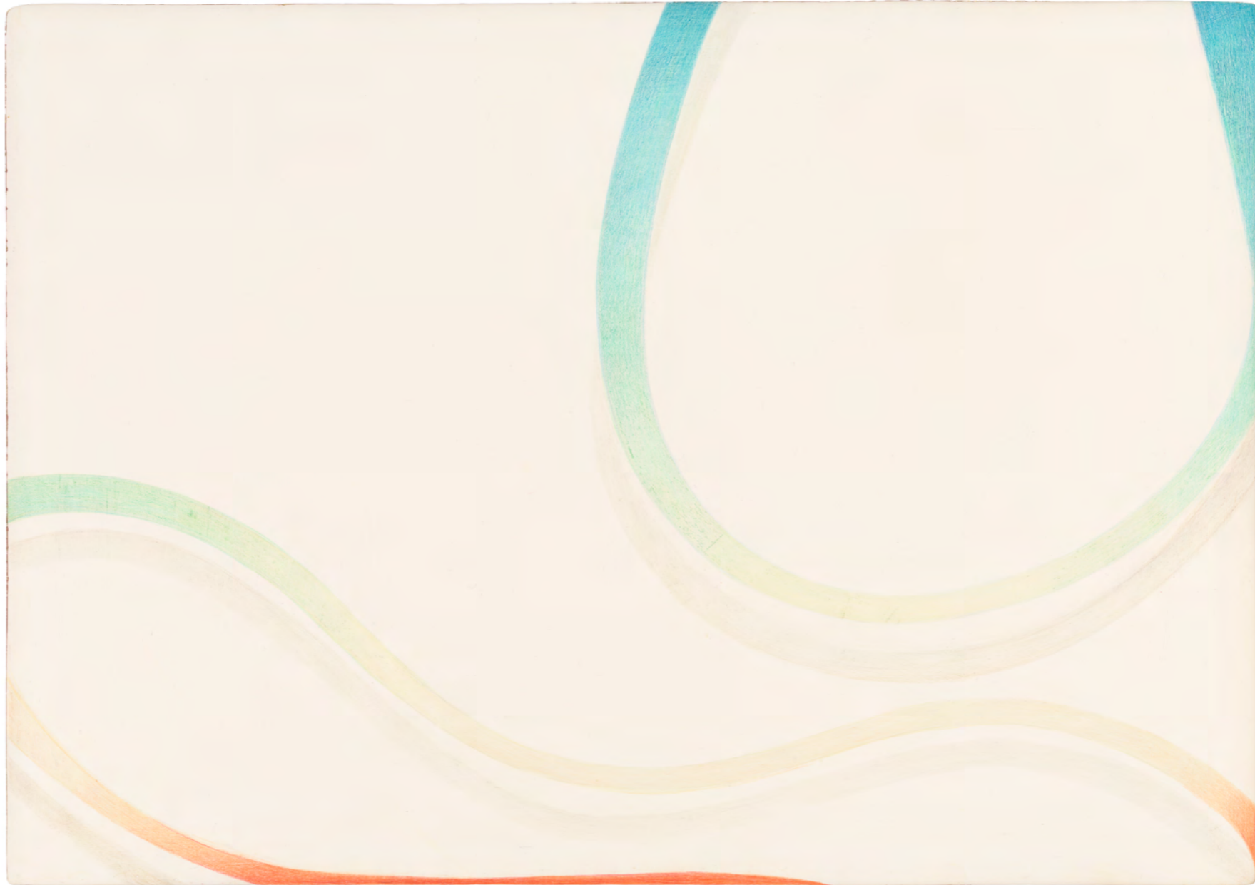
Annabelle d'Huart Untitled (from the Tabulae series), 2020

Colored pencil, Meudon whiting, and gold leaf on wood 10 1/2 x 15 in (27 x 38 cm) DHUART015