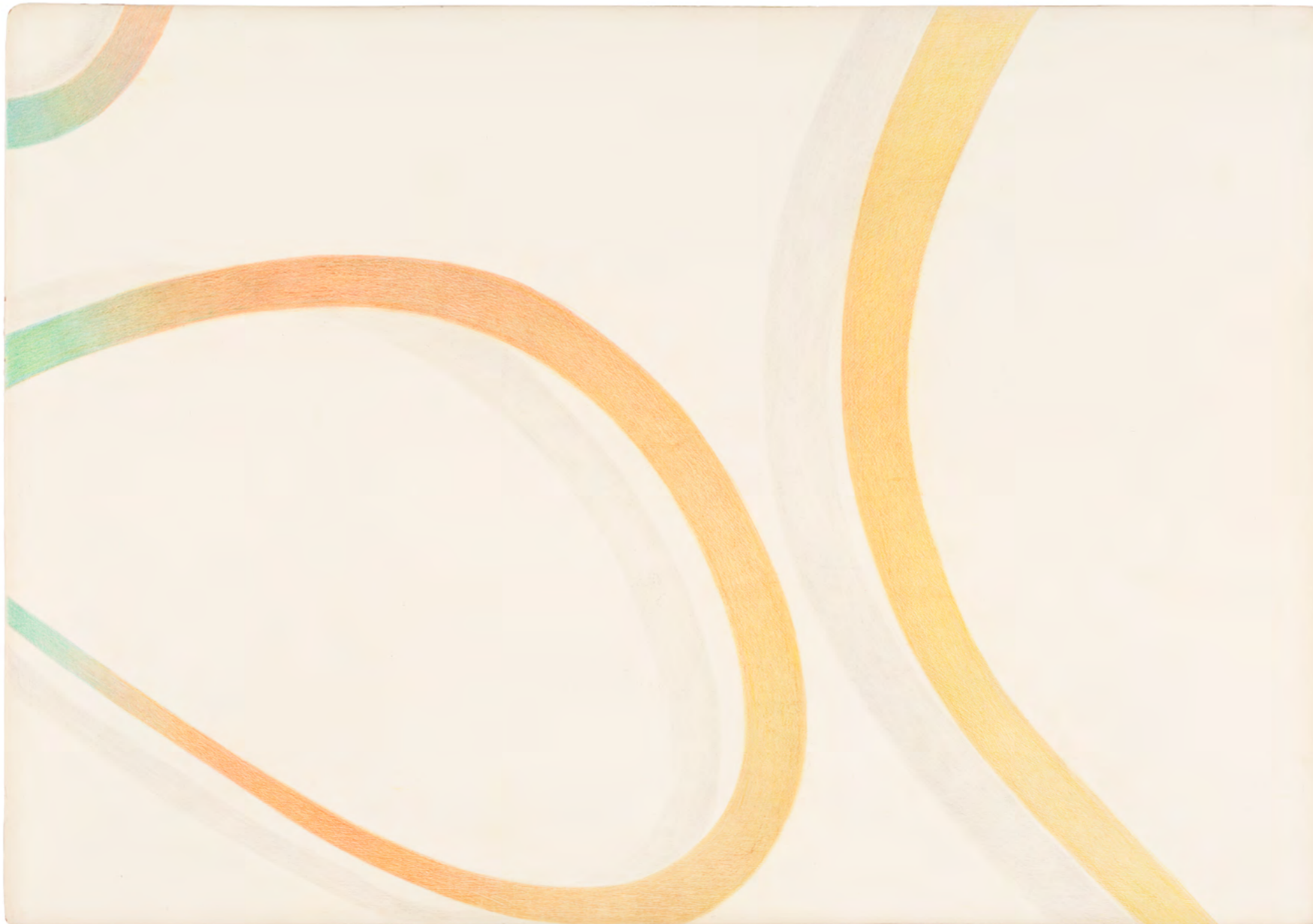
Annabelle d'Huart Untitled (from the Tabulae series), 2020

Colored pencil, Meudon whiting, and gold leaf on wood 10 1/2 x 15 in (27 x 38 cm) DHUART028