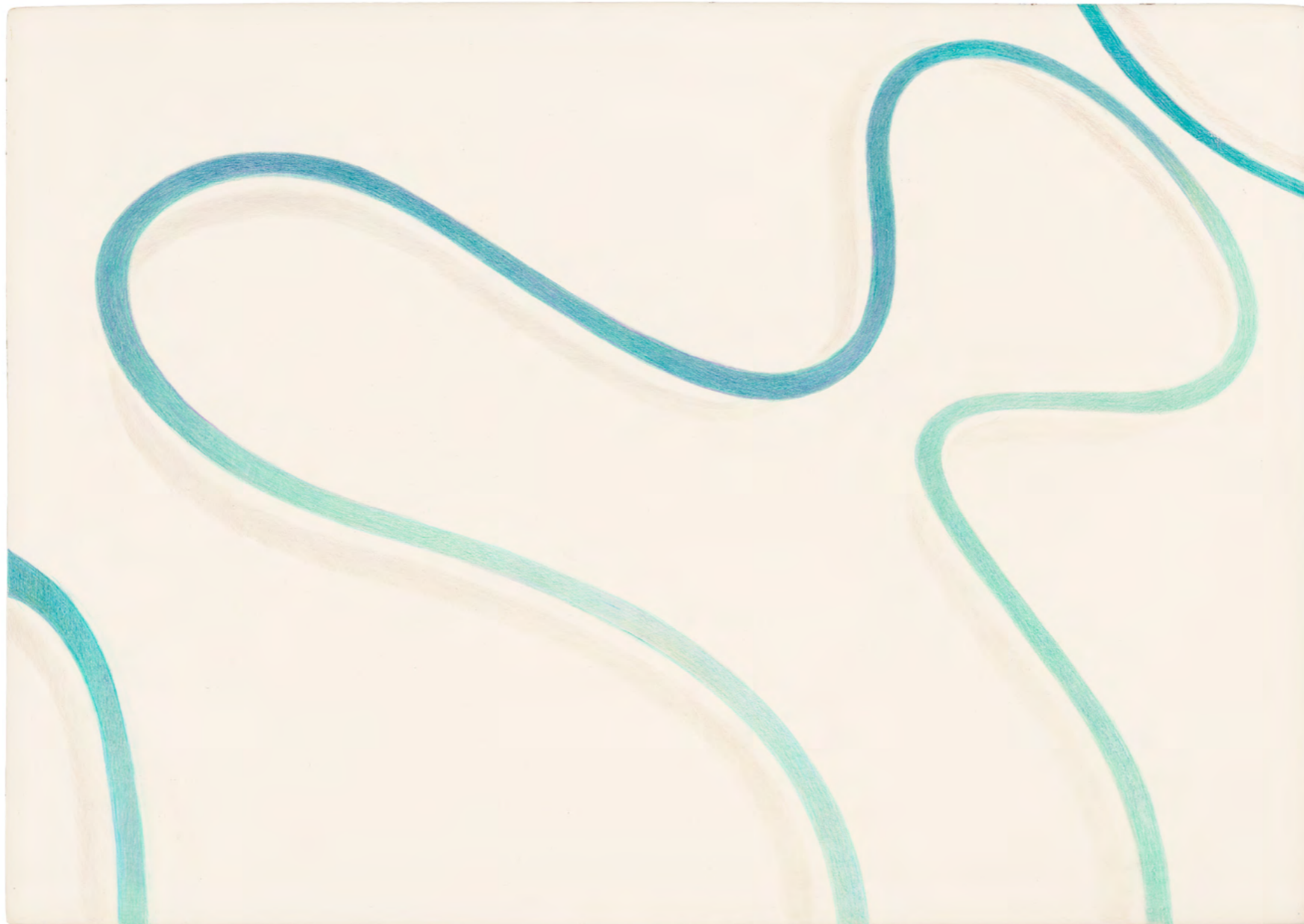
Annabelle d'Huart Untitled (from the Tabulae series), 2020

Colored pencil, Meudon whiting, and gold leaf on wood 10 1/2 x 15 in (27 x 38 cm) DHUART017