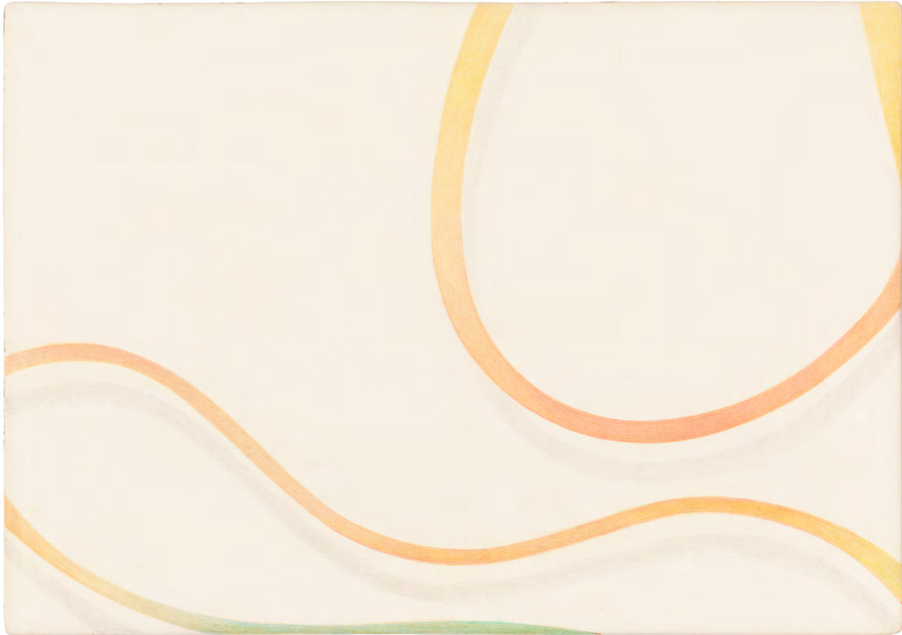
Annabelle d'Huart Untitled (from the Tabulae series), 2020

Colored pencil, Meudon whiting, and gold leaf on wood 10 1/2 x 15 in (27 x 38 cm) DHUART029