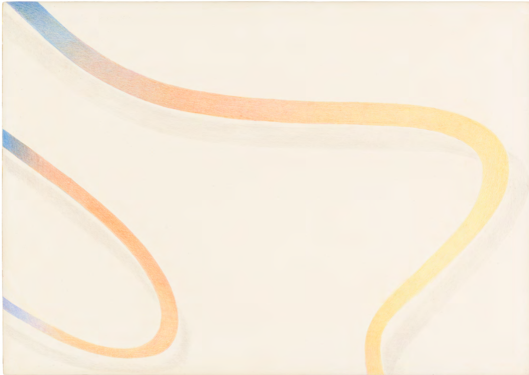
Annabelle d'Huart Untitled (from the Tabulae series), 2020

Colored pencil, Meudon whiting, and gold leaf on wood 10 1/2 x 15 in (27 x 38 cm) DHUART016