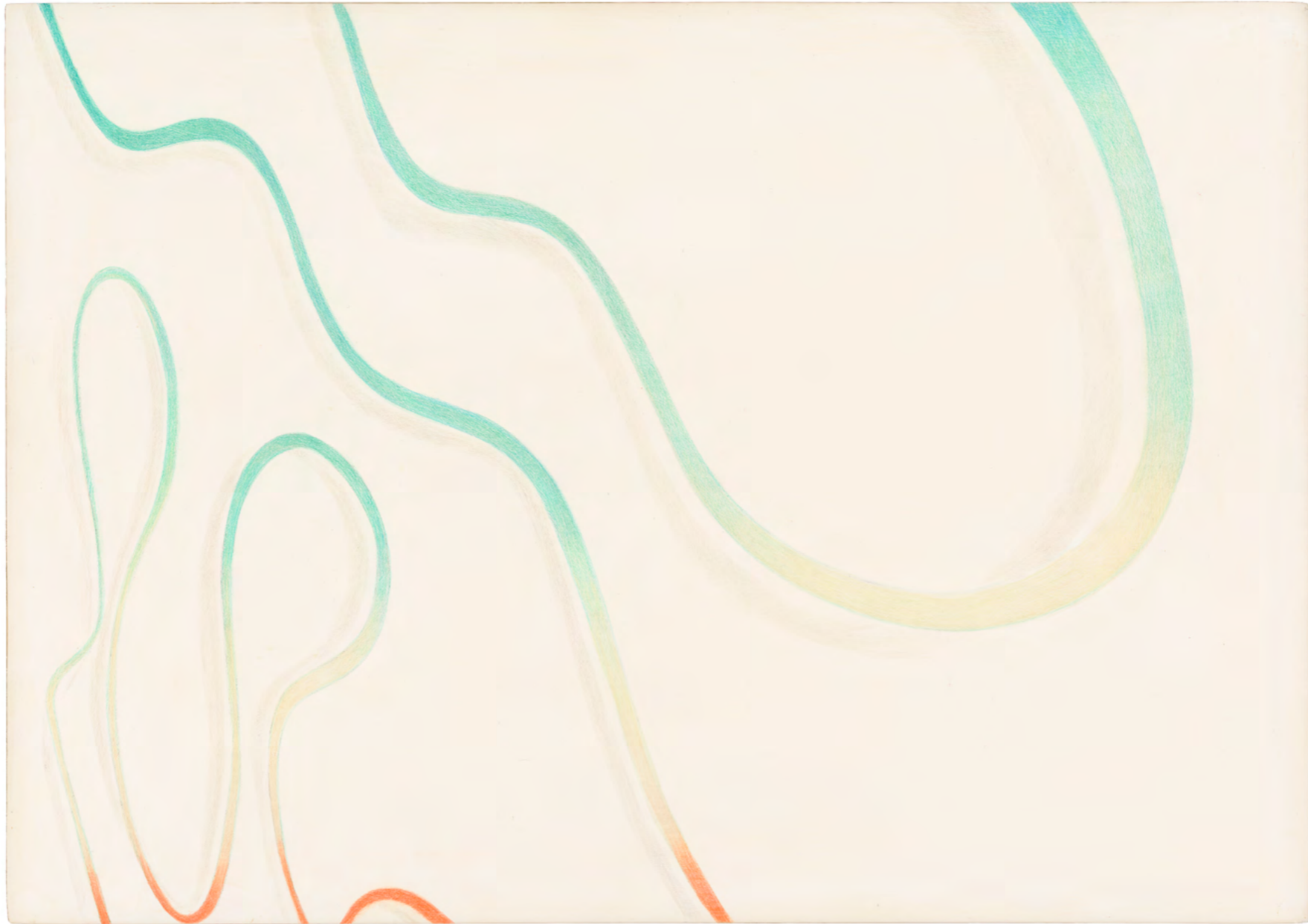
Annabelle d'Huart Untitled (from the Tabulae series), 2020

Colored pencil, Meudon whiting, and gold leaf on wood 10 1/2 x 15 in (27 x 38 cm) DHUART018